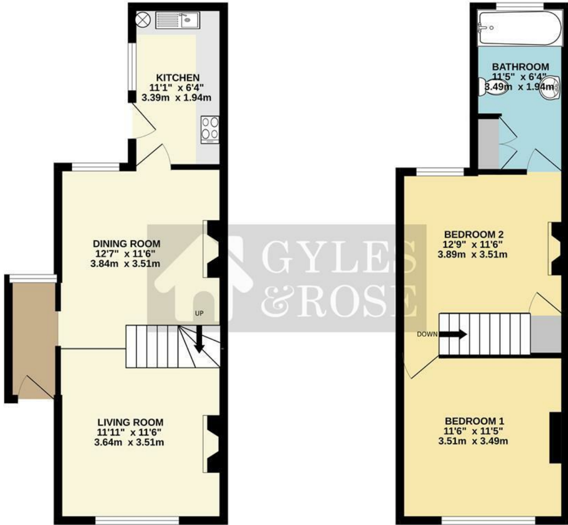
1ST FLOOR 345 sq.ft. (32.0 sq.m.) approx.

TOTAL FLOOR AREA : 718 sq.ft. (66.7 sq.m.) approx.