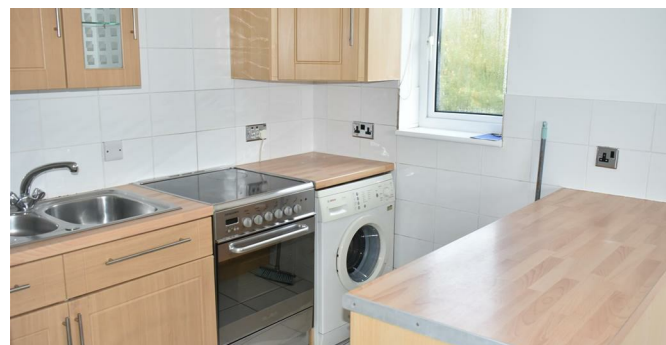
Chequers Court Bradley Stoke BS32 0HD