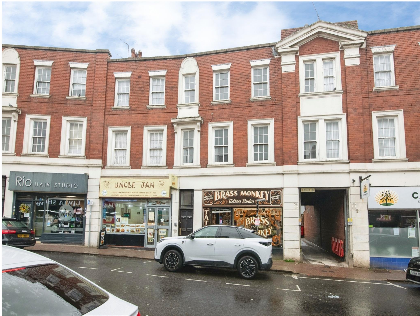
New Street, DUDLEY DY1 1LT