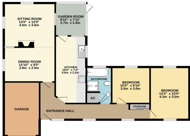
GROUND FLOOR 1071 sq.ft. (99.5 sq.m.) approx.

TOTAL FLOOR AREA: 1071 sq.ft. (99.5 sq.m.) approx.