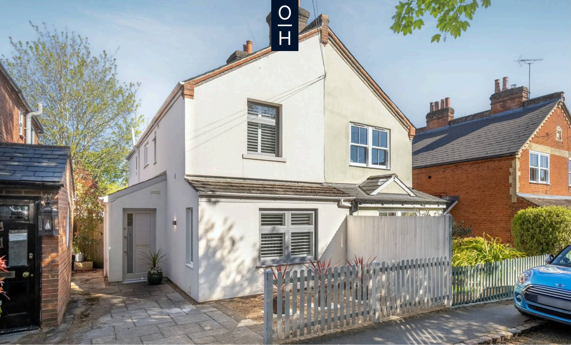
The Terrace, Sunninghill Guide Price £695,000