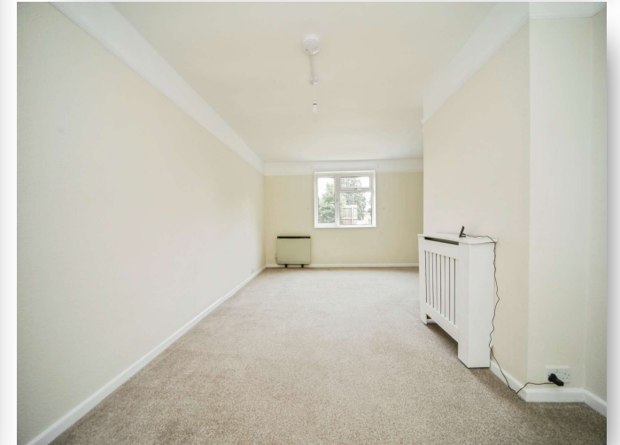
Salmond Drive, Barnham, Thetford, IP24 2NL