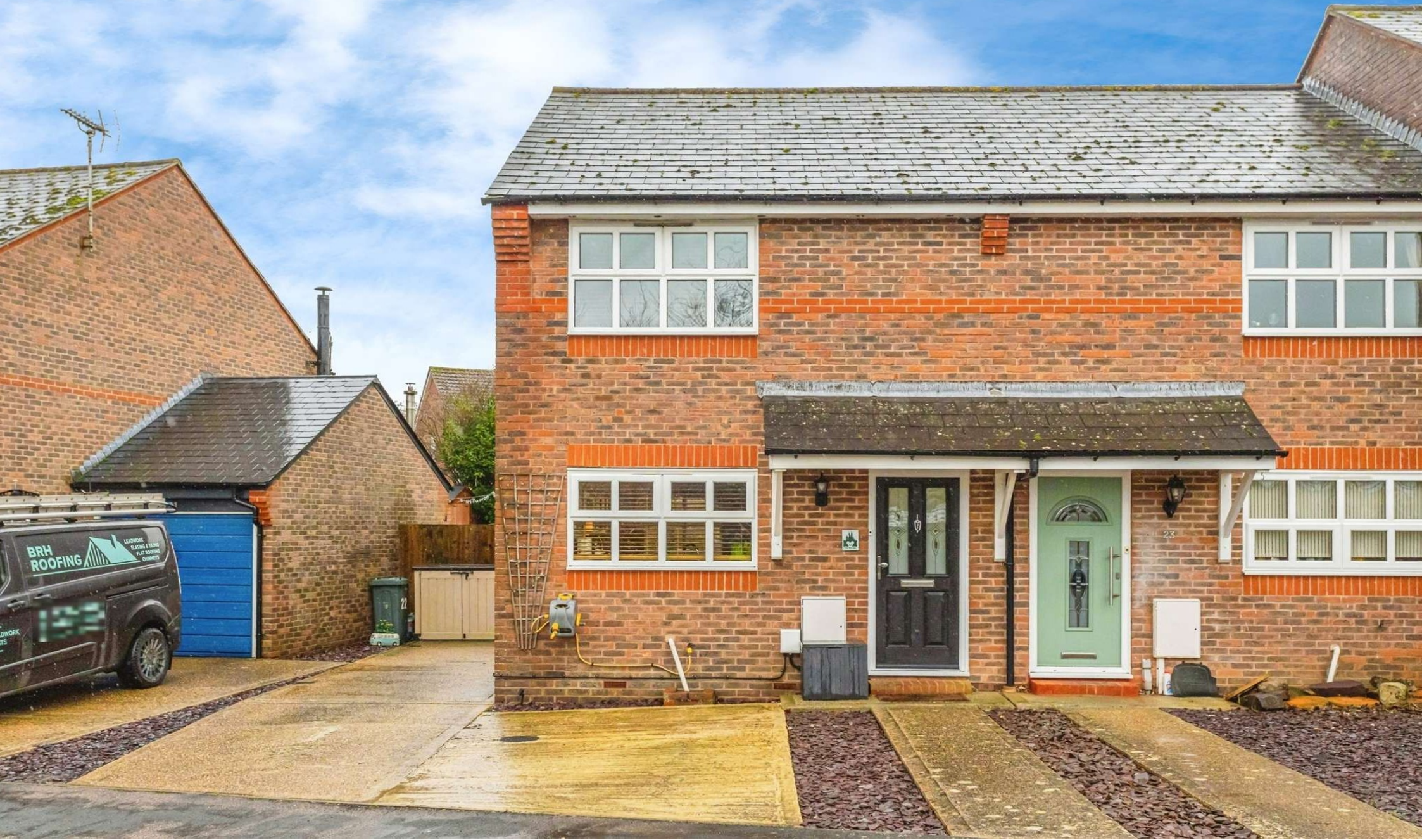
The Martlets, South Chailey, Lewes BN8 4QG