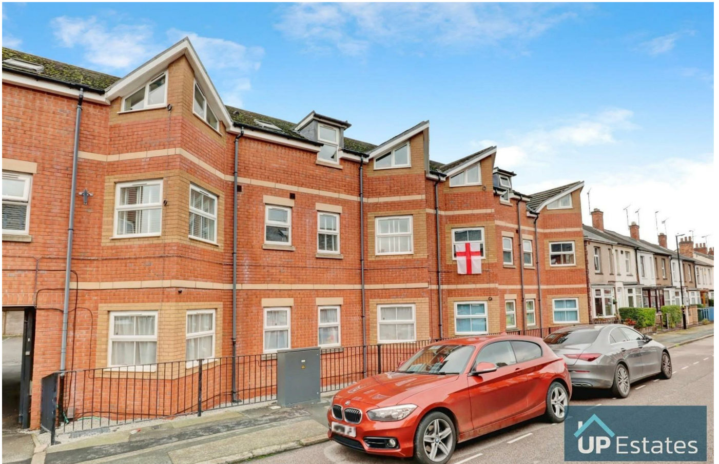
Shakleton Road, Coventry