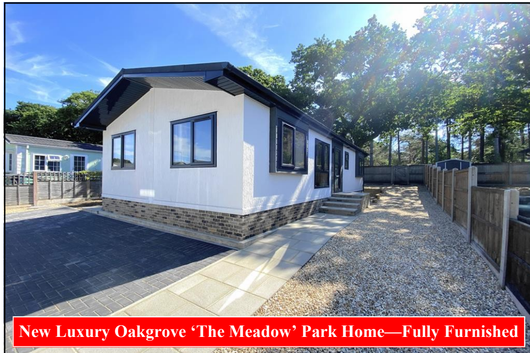
New Luxury Oakgrove 'The Meadow' Park Home—Fully Furnished

67 The Avenue, Oaktree Park, St Leonards, Ringwood. BH24 2RJ