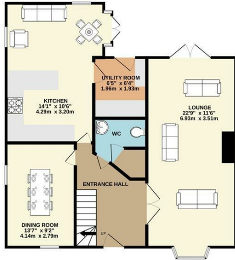
GROUND FLOOR 706 sq.ft. (65.5 sq.m.) approx.