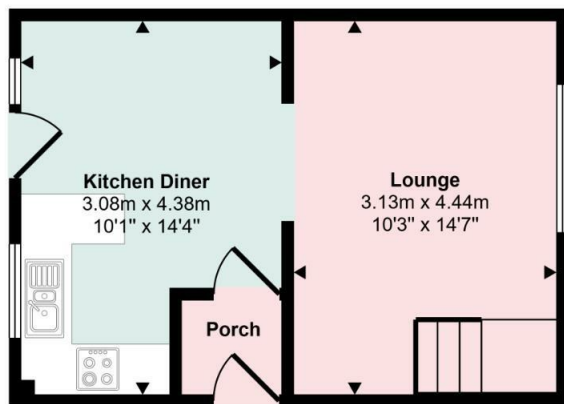
Ground Floor Approx 28 sq m / 302 sq ft

Approx Gross Internal Area 57 sq m / 612 sq ft