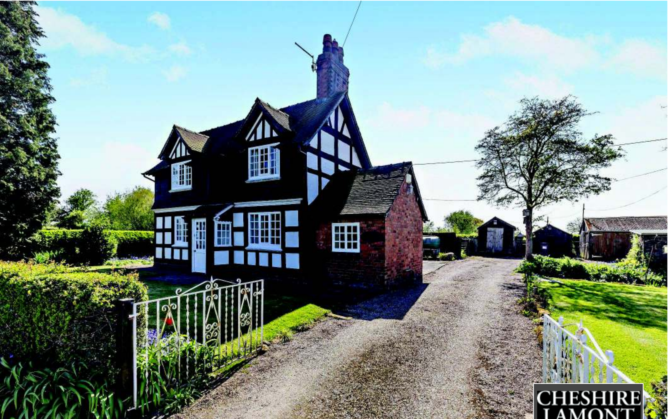
Swanwick Green Whitchurch