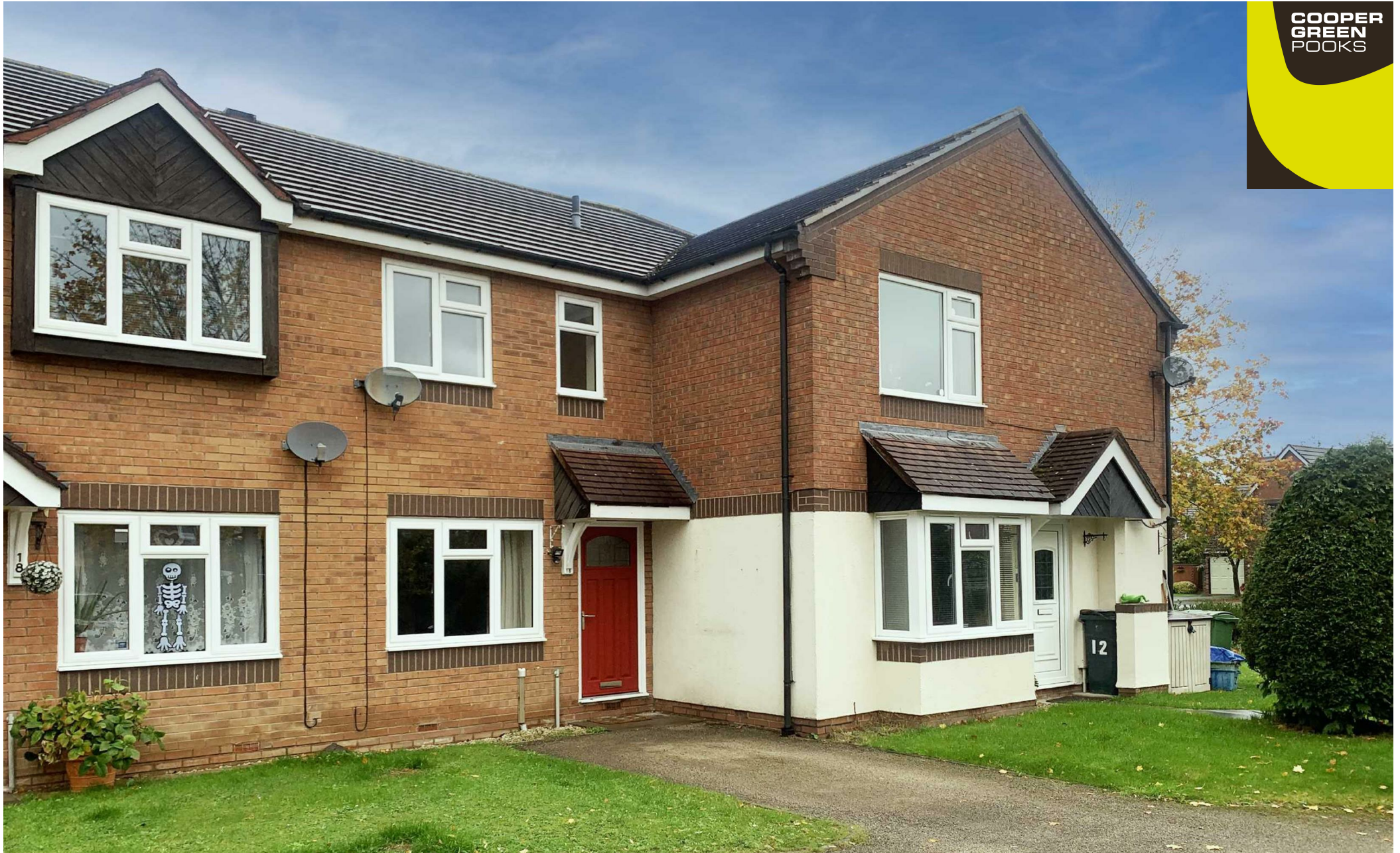
16, Barkstone Drive, Herongate, Shrewsbury, SY1 3XT £800 Per Month