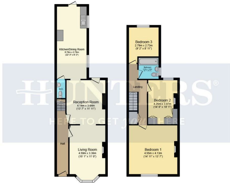
Ground Floor Floor area 60.2 sq.m. (648 sq.ft.)