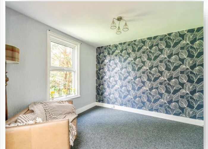
Westergate Street, Westergate Chichester PO20 3QR