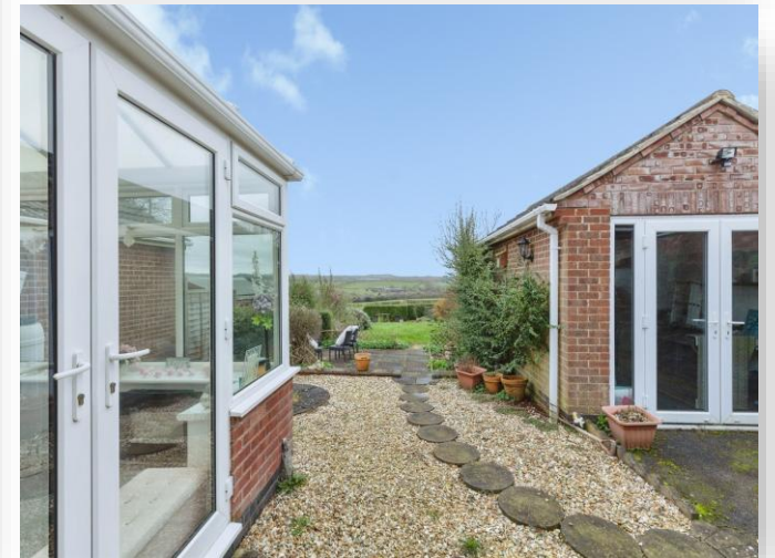
Station Road, Bagworth, COALVILLE