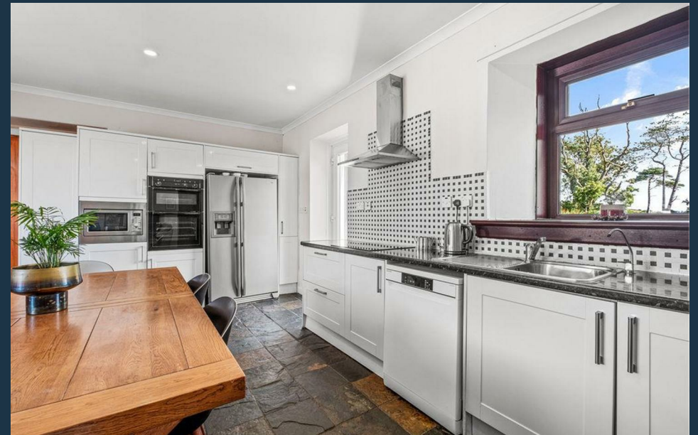
The photographs displayed show the wonderfully bright lounge with open fireplace and spacious family sized dining kitchen