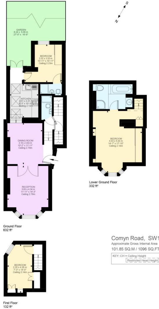
Illustration for identification purposes only. Not to scale. Floor Plan Drawn According To RICS Guidelines.

Chesterton Global Ltd trading as Chestertons for themselves and for the vendor of this property whose agents they are, give notice that (i) these particulars do not constitute any part of an offer or contract, (ii) all statements contained within these particulars are made without responsibility on the part of Chestertons or the vendor, (iii) whilst made in good faith, none of the statements contained within these particulars are to be relied upon as a statement or representation of fact, (iv) any intending purchasers must satisfy themselves by inspection or otherwise as to the correctness of each of the statements contained within these particulars, (v) the vendor does not make or give either Chestertons or any person in their employment any authority to make or give representation or warranty whatsoever in relation to this property. Wide angle lenses may be used. ©Copyright Chestertons | Chesterton Global Ltd | Registered Office 40 Connaught Street, Hyde Park, London W2 2AB Registered Company Number 05334580.