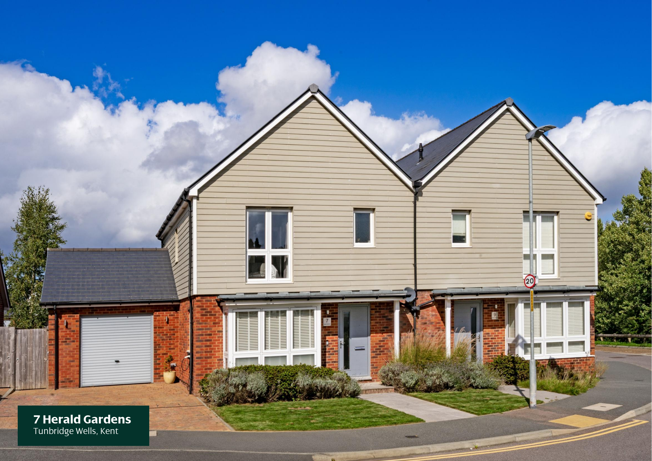
7 Herald Gardens Tunbridge Wells, Kent