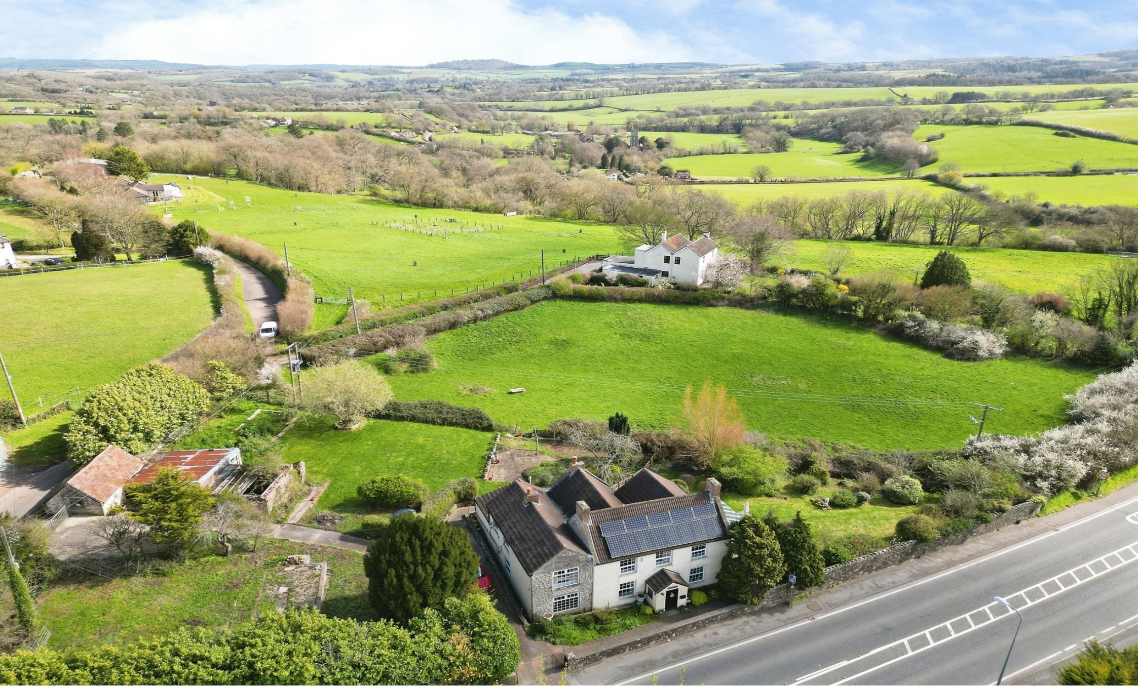
Oakleigh Pensford Hill, Pensford Bristol BS39 4JF