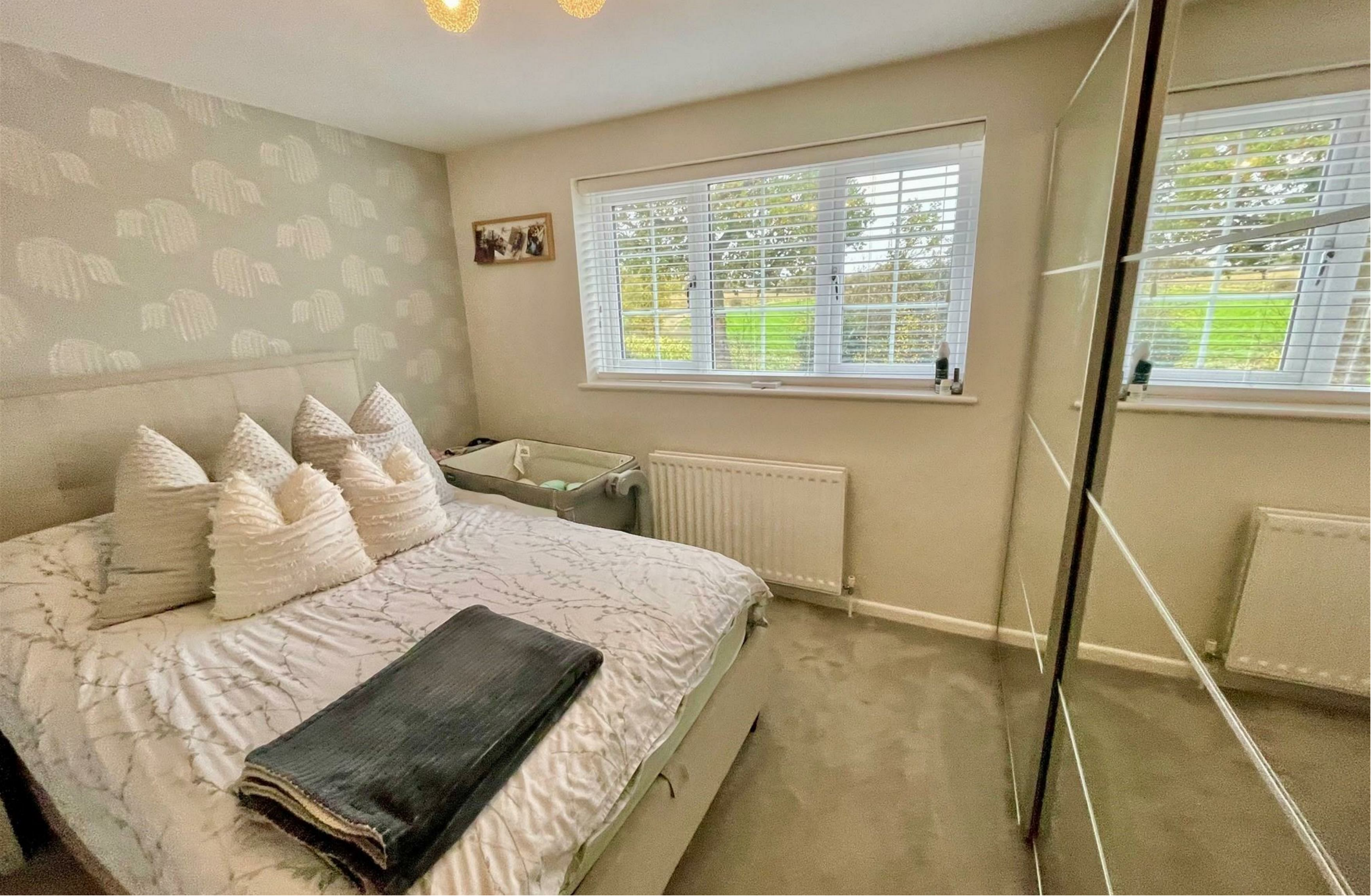
9 Cherry Tree Lane, Potters Bar, EN6 2QG