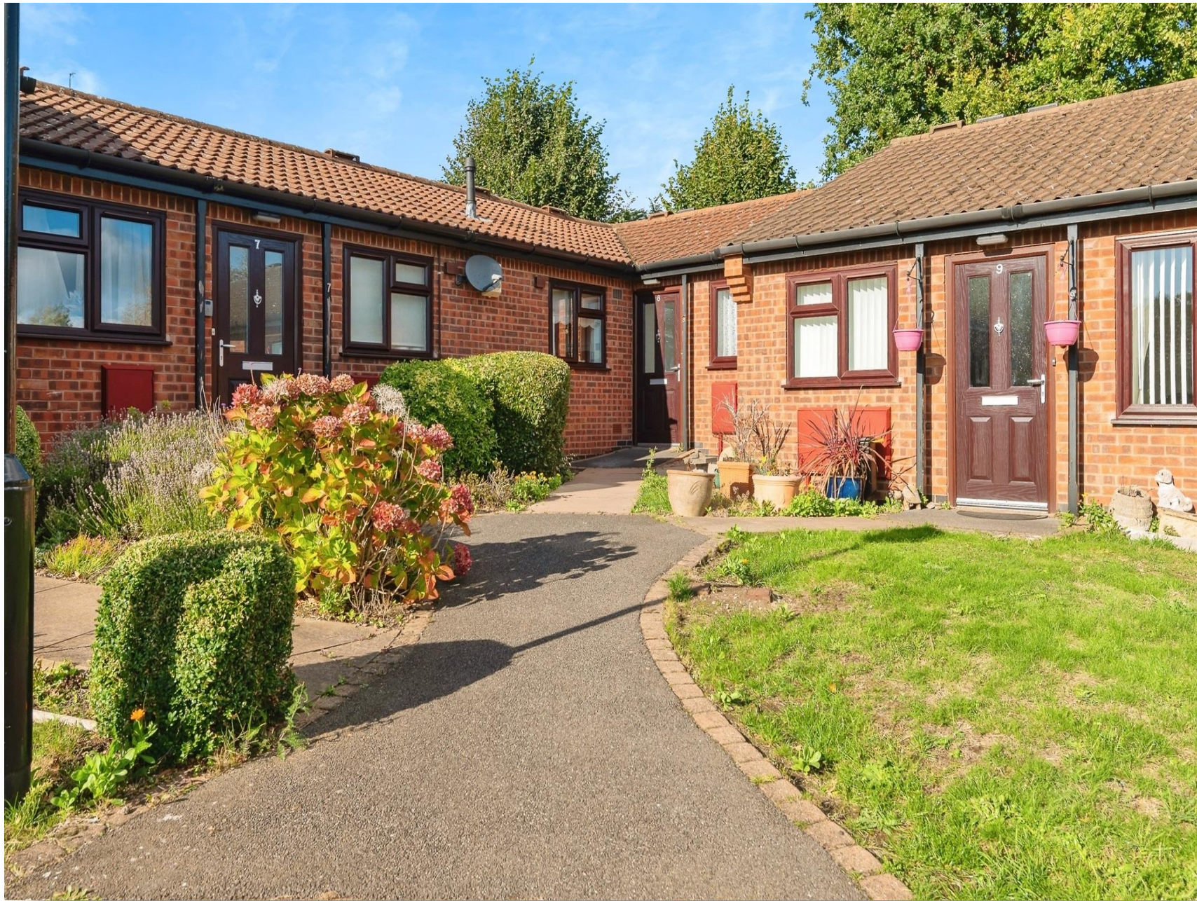
Rosemary Close, Nottingham NG8 6GL