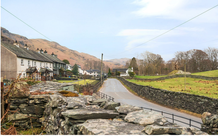
Chapel Stile Fell Views