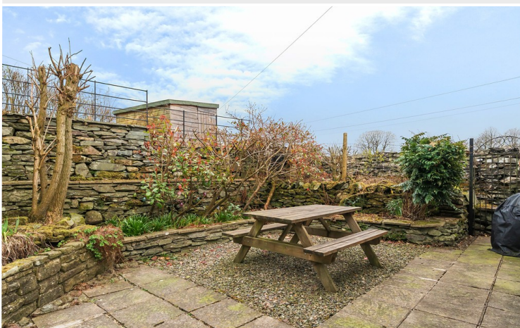
Patio Seating Area