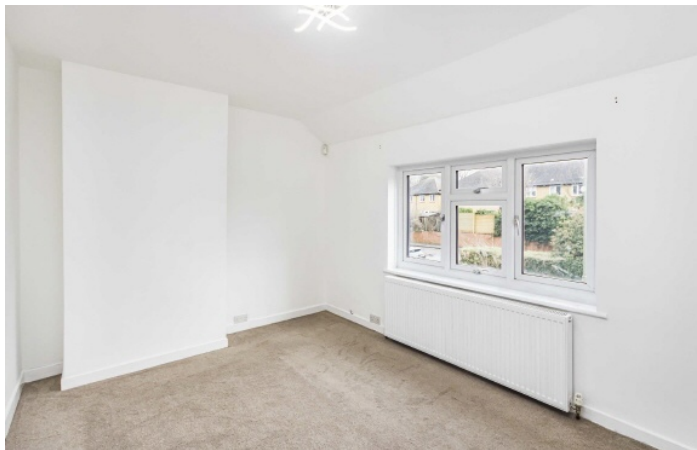
Fleece Road, KT6