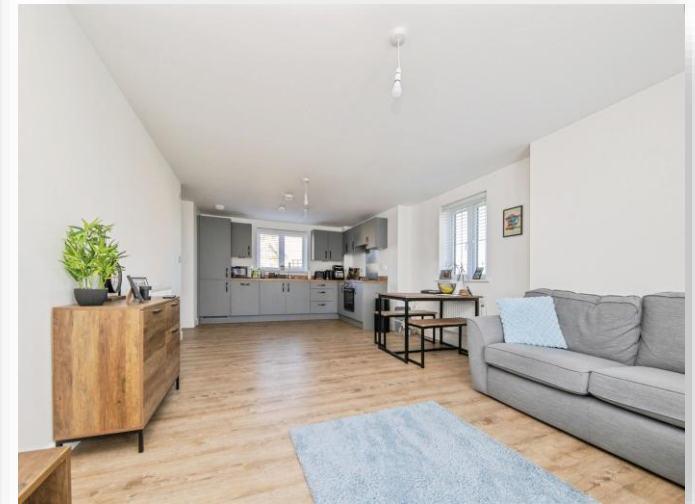
Vale View Road, Sproughton, Ipswich, IP8 3FS