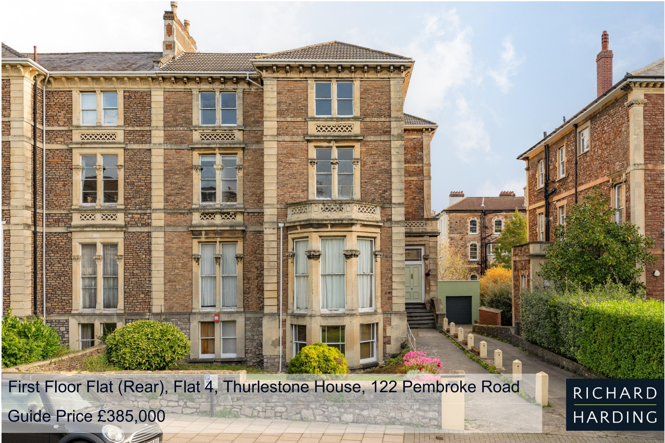
First Floor Flat (Rear), Flat 4, Thurlestone House, 122 Pembroke Road Guide Price £385,000