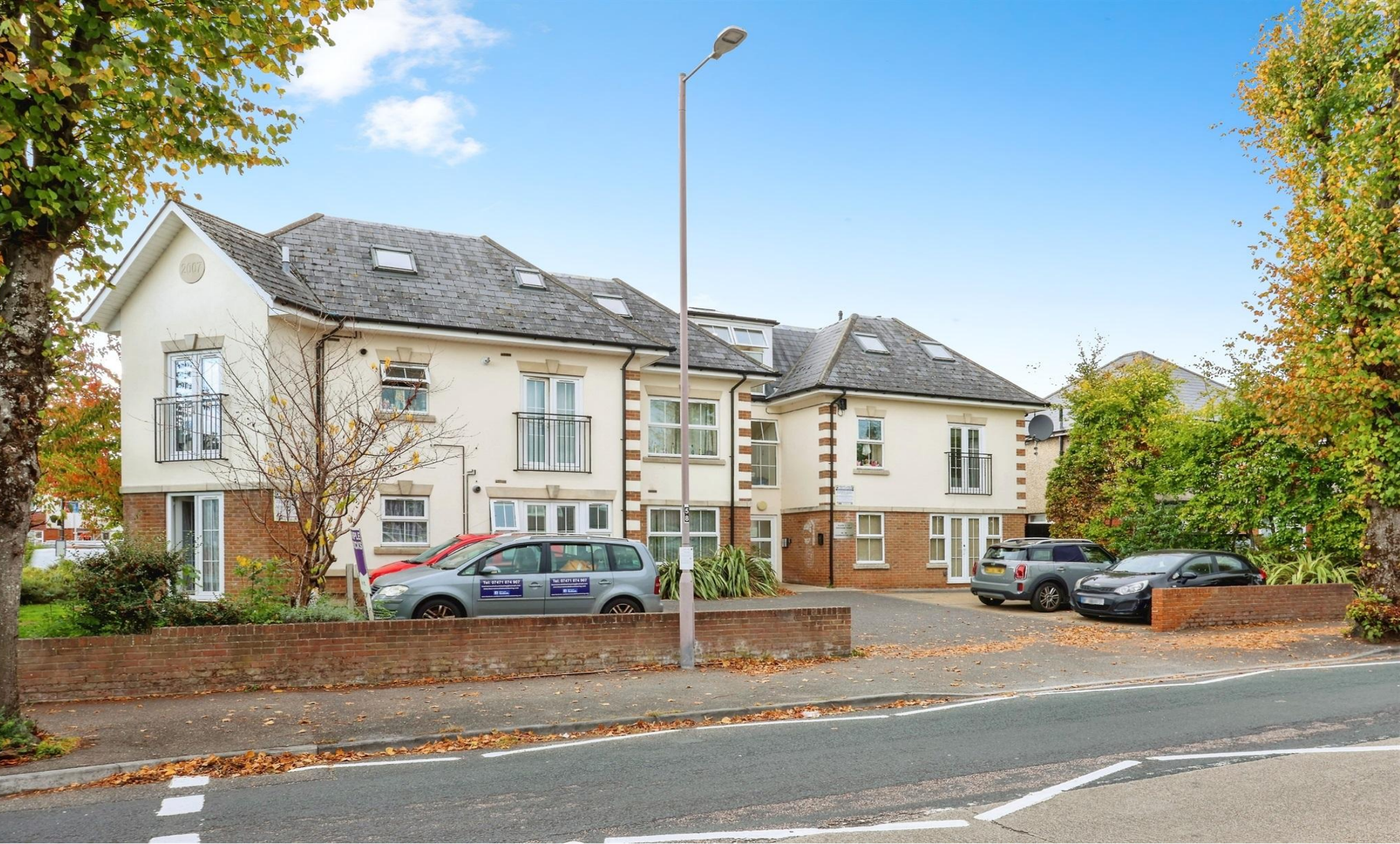
Gresham Point Charminster Avenue, BOURNEMOUTH BH9 1SB