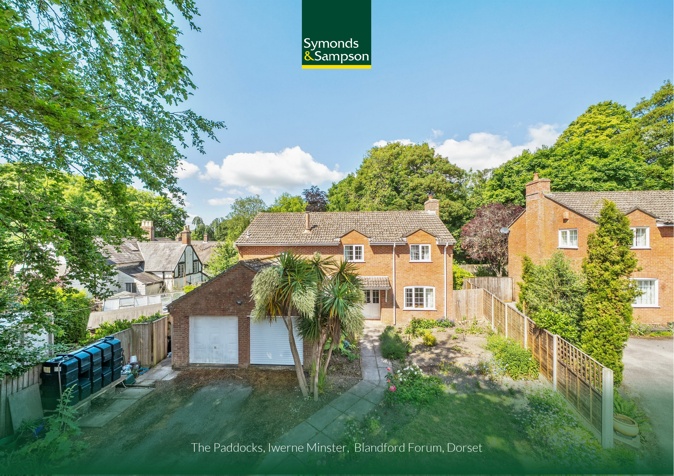
The Paddocks, Iwerne Minster, Blandford Forum, Dorset