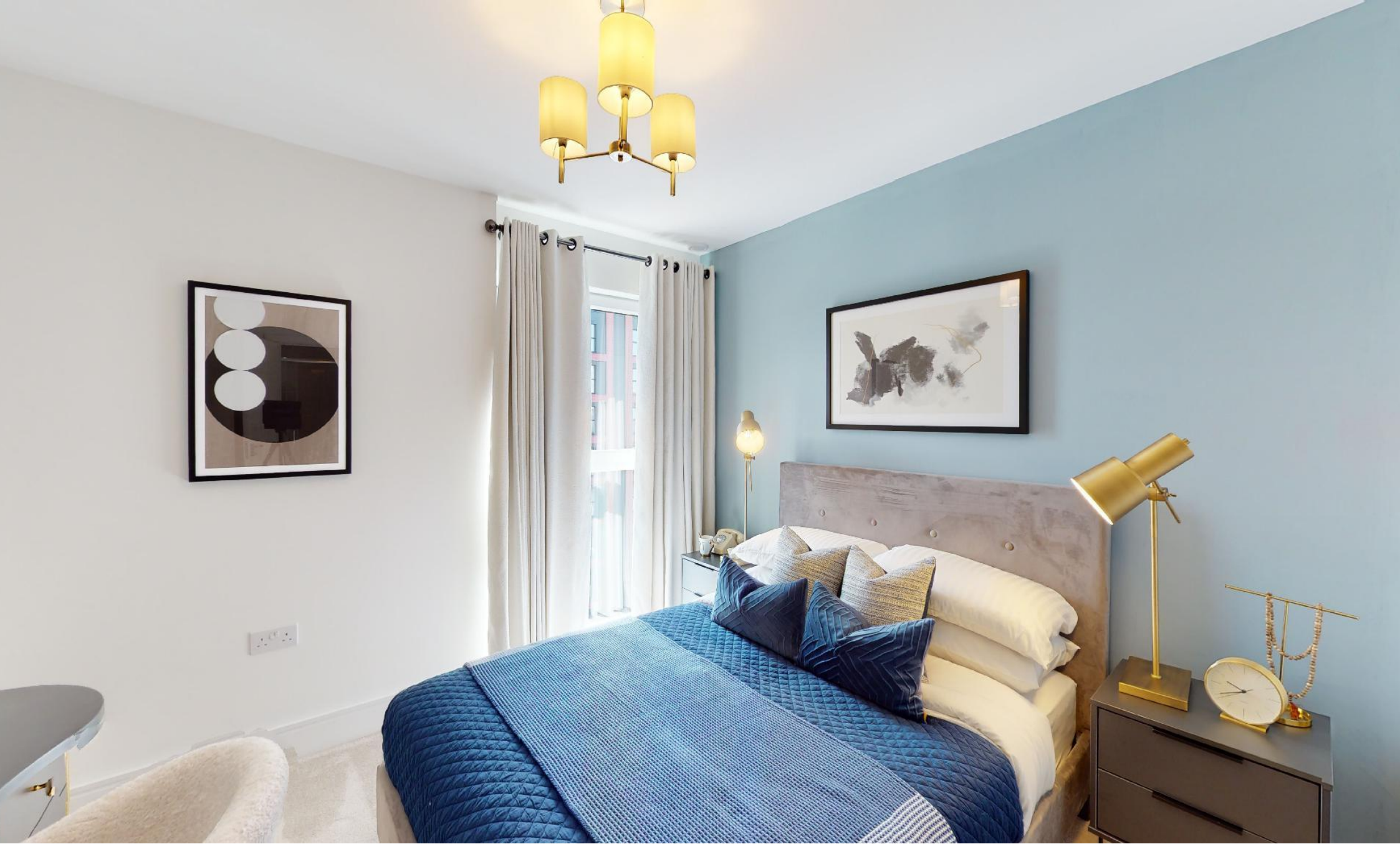
Granada House, Meridian Way Southampton SO14 0FT