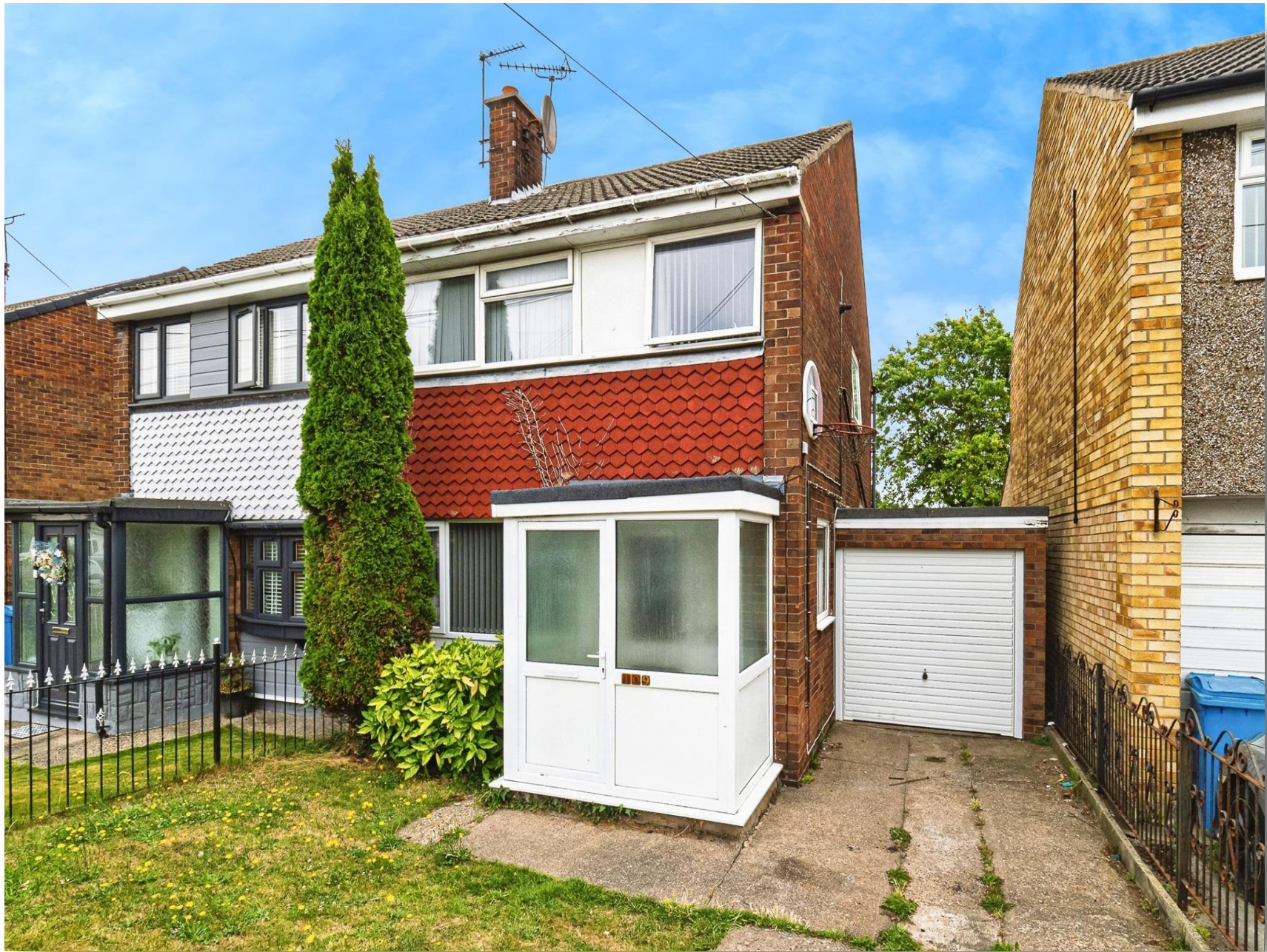
Ridgestone Avenue, Bilton, Hull, HU11 4AJ