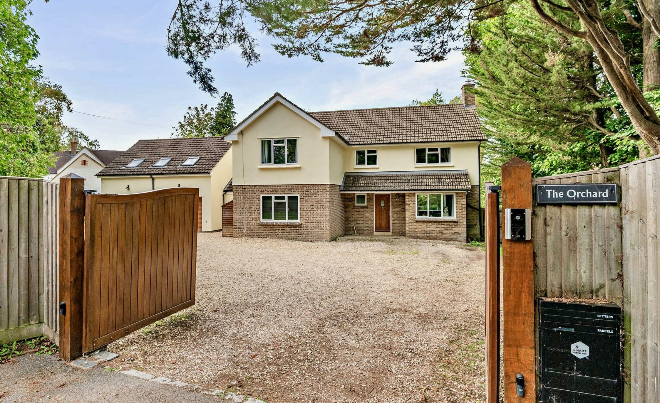
The Orchard Baunton Lane, Stratton, Cirencester, GL7 2LN Asking Price £1,200,000