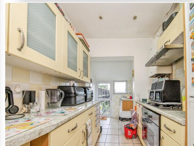
Alexandra Terrace, Colchester, CO3 3DE