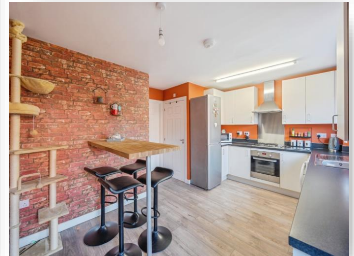
Sadler Drive, Doveridge, Ashbourne. DE6 5PN