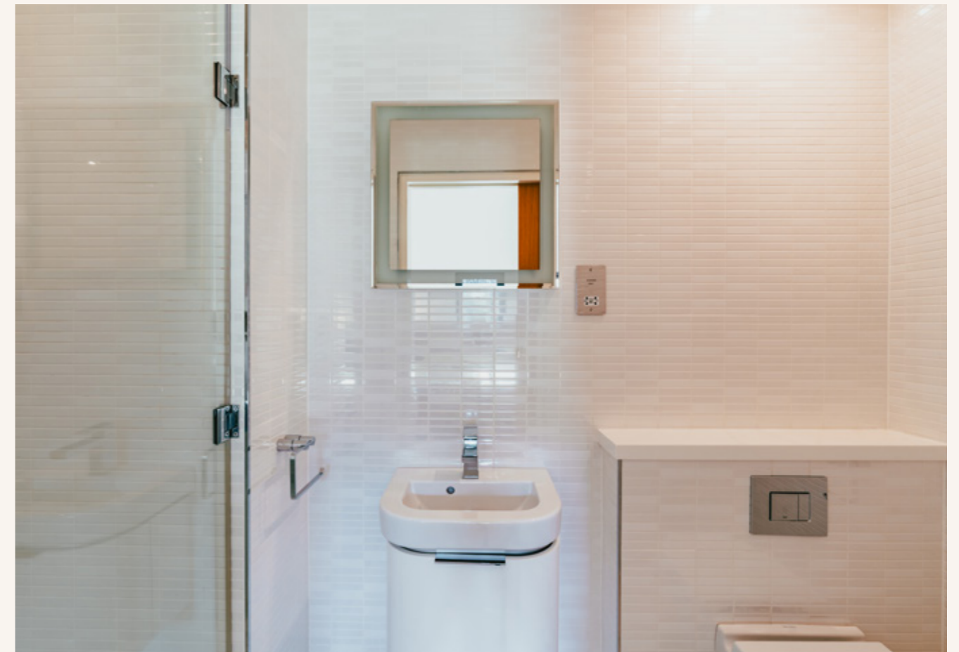
BEDROOM 4 EN-SUITE SHOWER ROOM