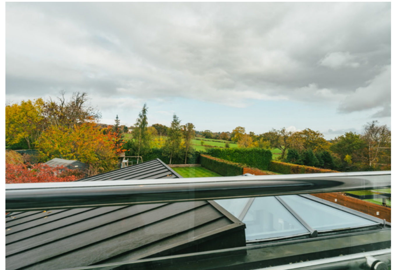
BEDROOM 2 JULIET BALCONY VIEW