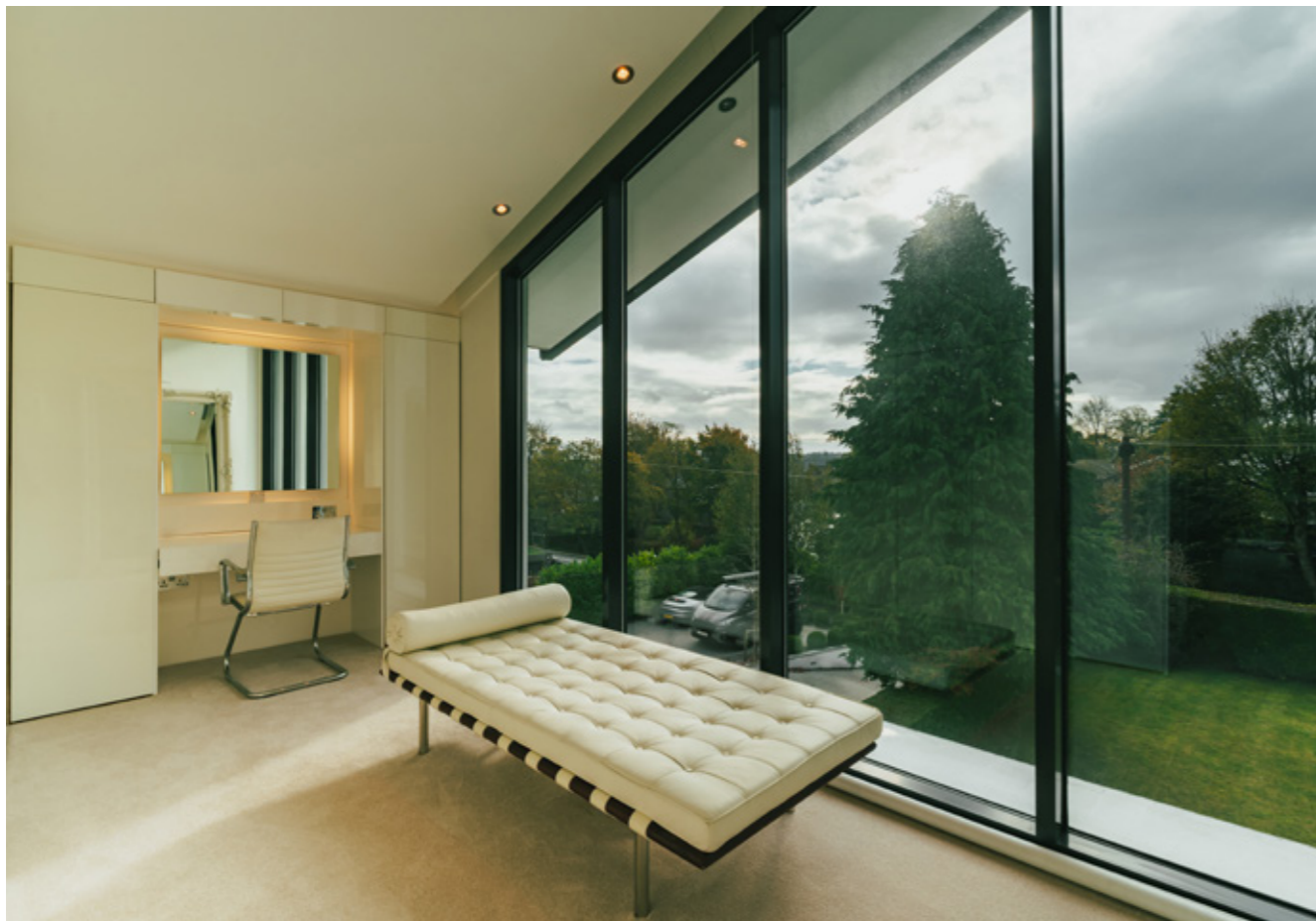
MASTER DRESSING ROOM