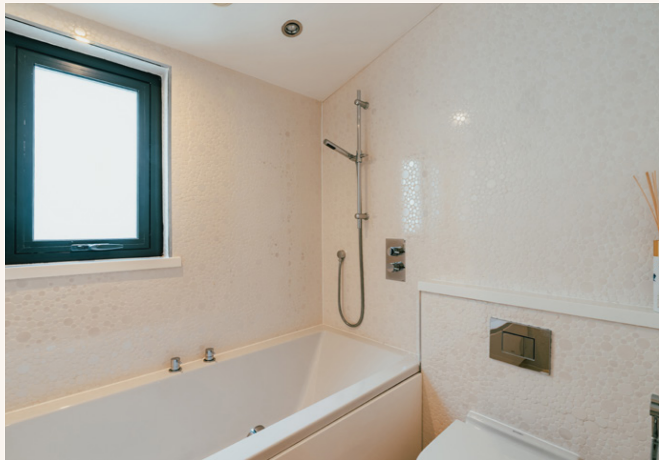
BEDROOM 3 EN-SUITE BATHROOM