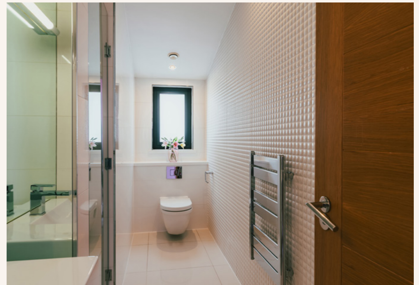
BEDROOM 2 EN-SUITE SHOWER ROOM