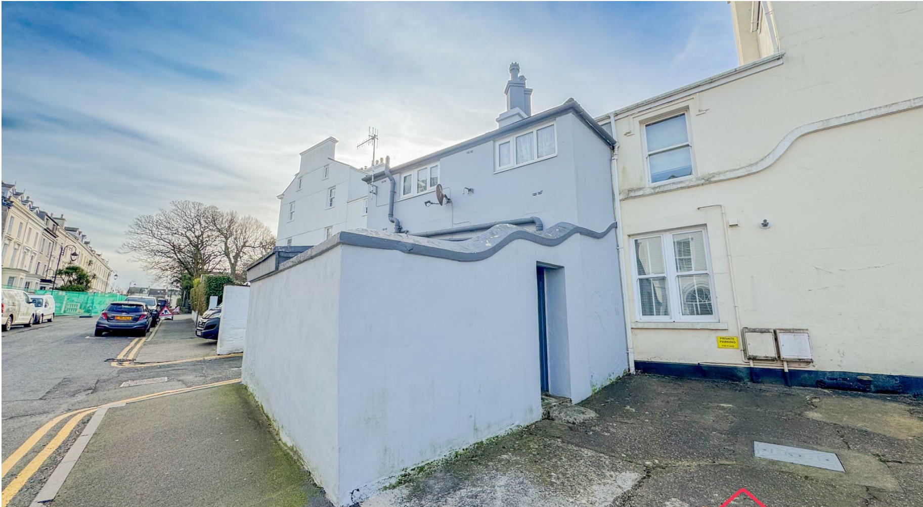
3a Derby Road, Douglas, Isle Of Man, IM2 3ES Asking Price £230,000