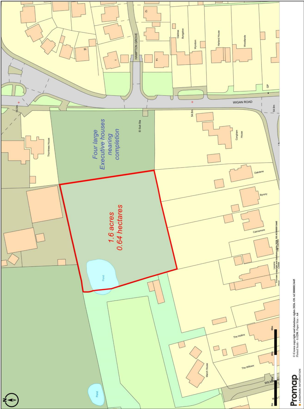
Residential Development Land adjoining Thorntree House, Wigan Road, Cuerden, Leyland, PR25 5SB