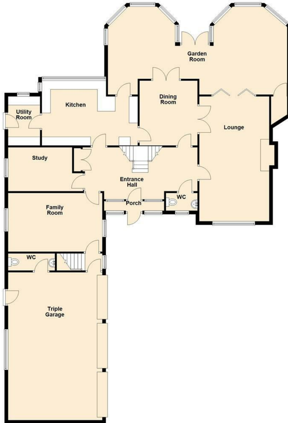
Ground Floor Approx. 170.3 sq. metres (1833.1 sq. feet)