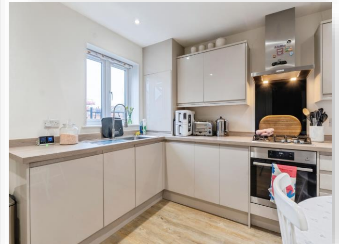
Windlass Close, Loughborough