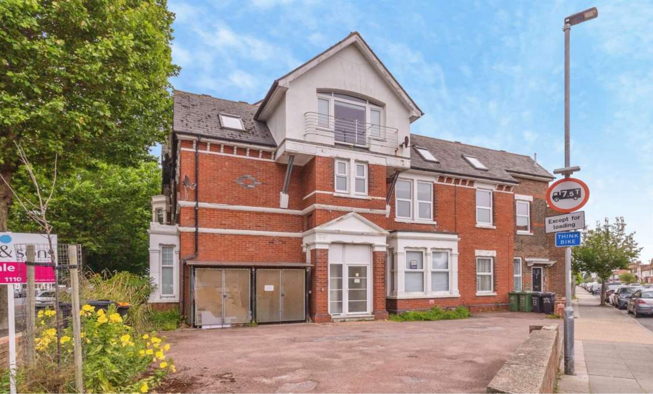
Mayfield House London Road, Portsmouth PO2 9JE