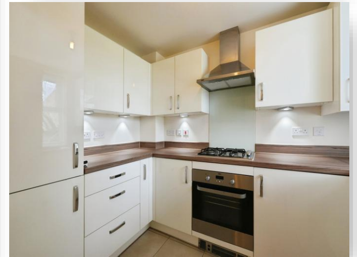
Cox Meadow Road, Leicester Forest East Leicester LE3 3QD