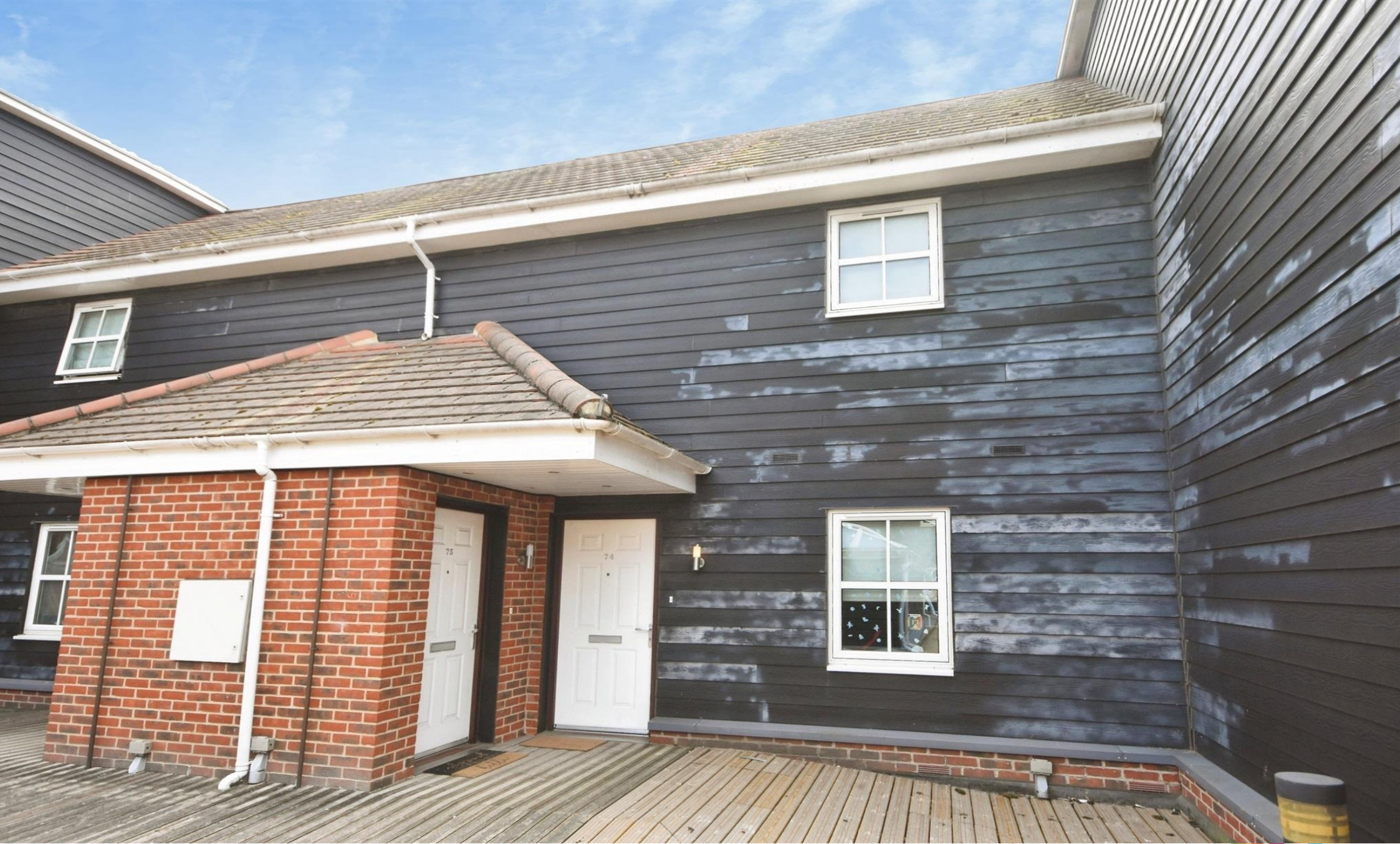
Nayland Court, Market Place, Romford, RM1 3EF