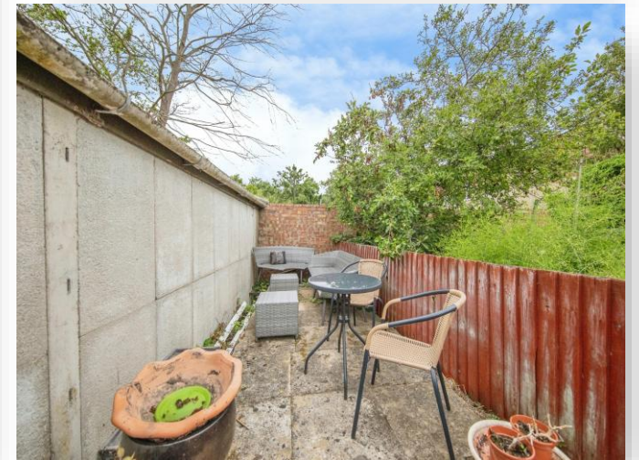
Land To The North Side Of Pytches Road, Woodbridge IP12 1EP