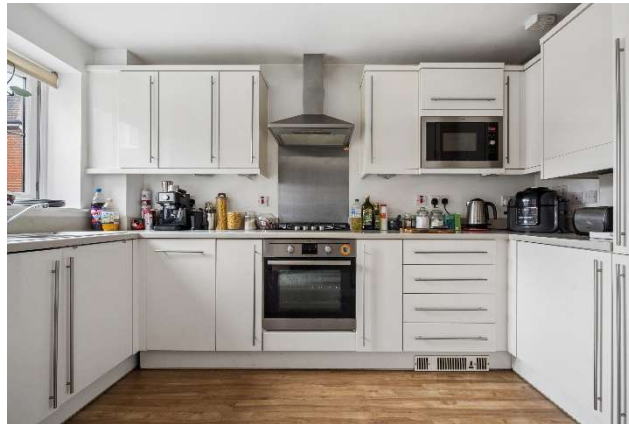
KITCHEN fitted with a single drainer sink unit set in laminated work surface with ample drawers and cupboards under, electric oven with four plate gas hob and cooker hood over, ample wall cupboards, one housing wall mounted gas fired central heating boiler, integrated fridge/freezer, dishwasher and washing machine.