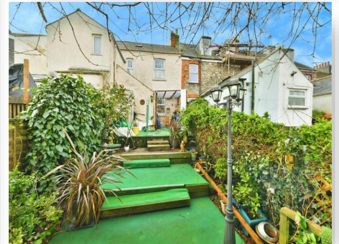
Underwood Road, Plympton PL7 1TA