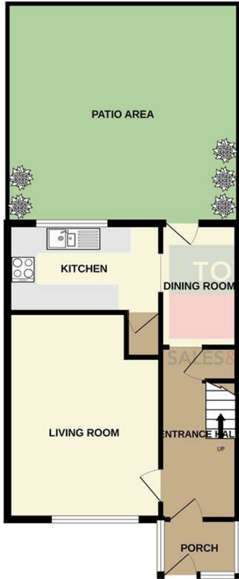
GROUND FLOOR 435 sq.ft. (40.4 sq.m.) approx.