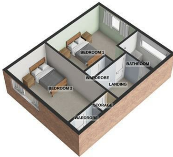
TOTAL FLOOR AREA : 844 sq.ft. (78.4 sq.m.) approx.

For illustrative purposes only. Decorative finishes, fixtures, fittings and furnishings do not represent the current state of the property. Measurements are approximate. Not to scale. Made with Metropix © 2025