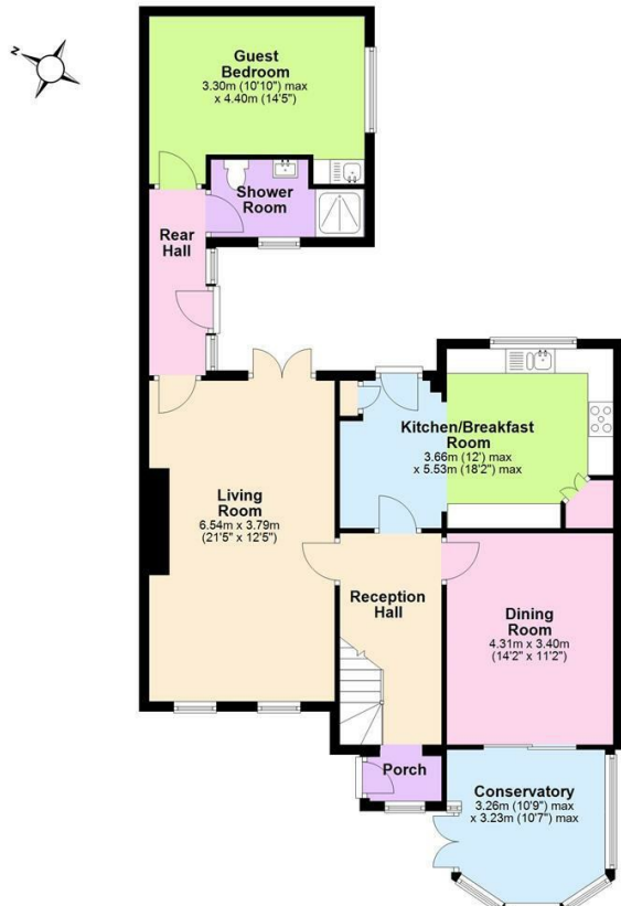
Ground Floor Approx. 103.0 sq. metres (1108.2 sq. feet)