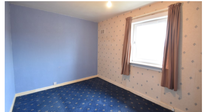
7 Dean Street