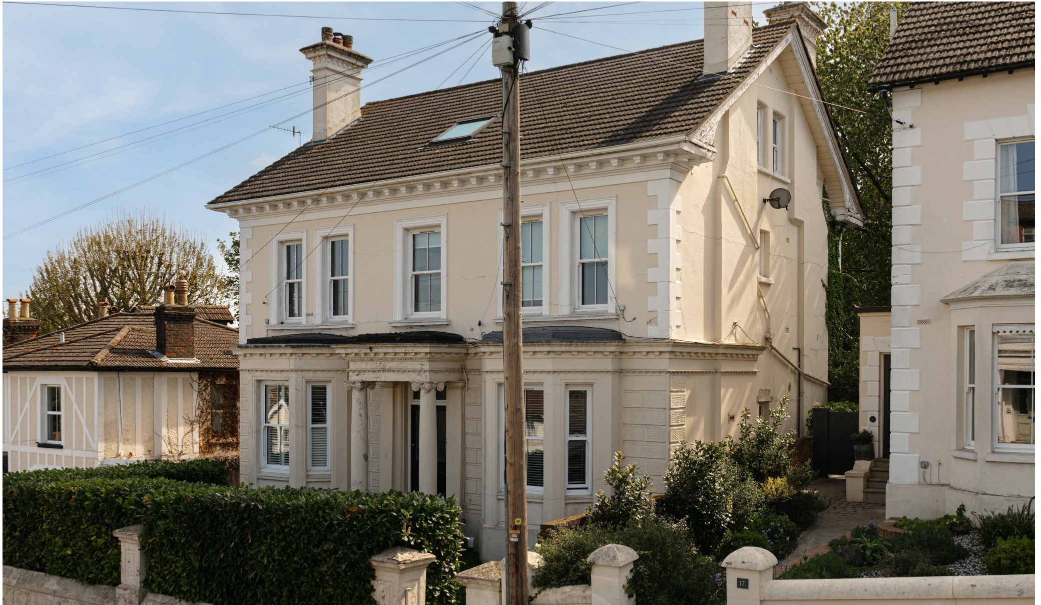
Upper Bridge Road, Redhill £300,000