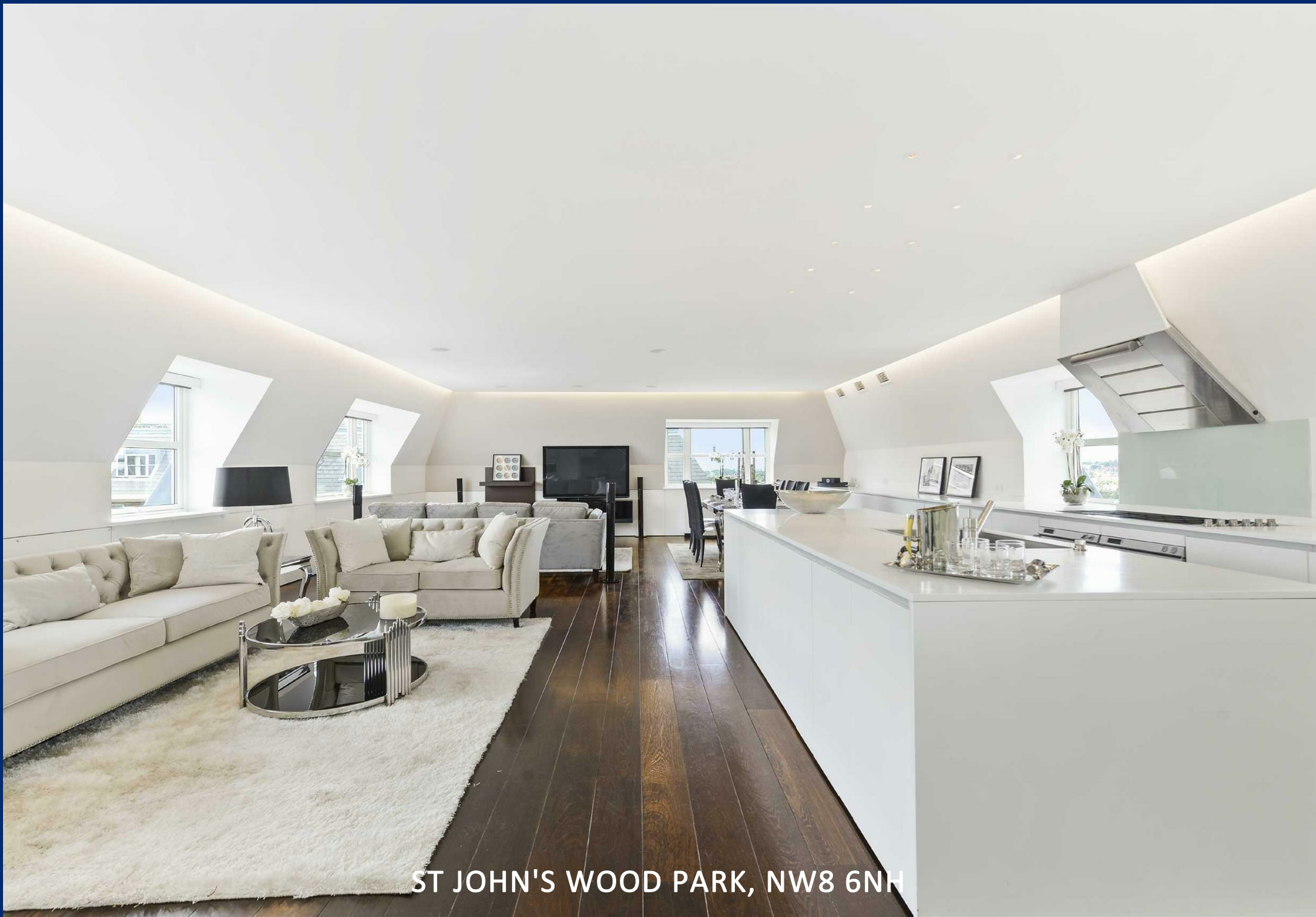
ST JOHN'S WOOD PARK, NW8 6NH