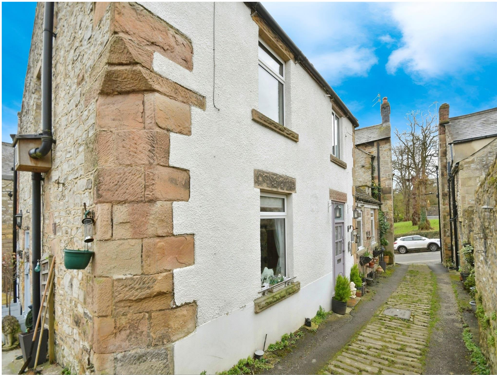
Barratts Yard North Church Street, Bakewell DE45 1DB